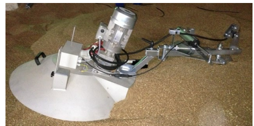
Single Unit with electric rudder